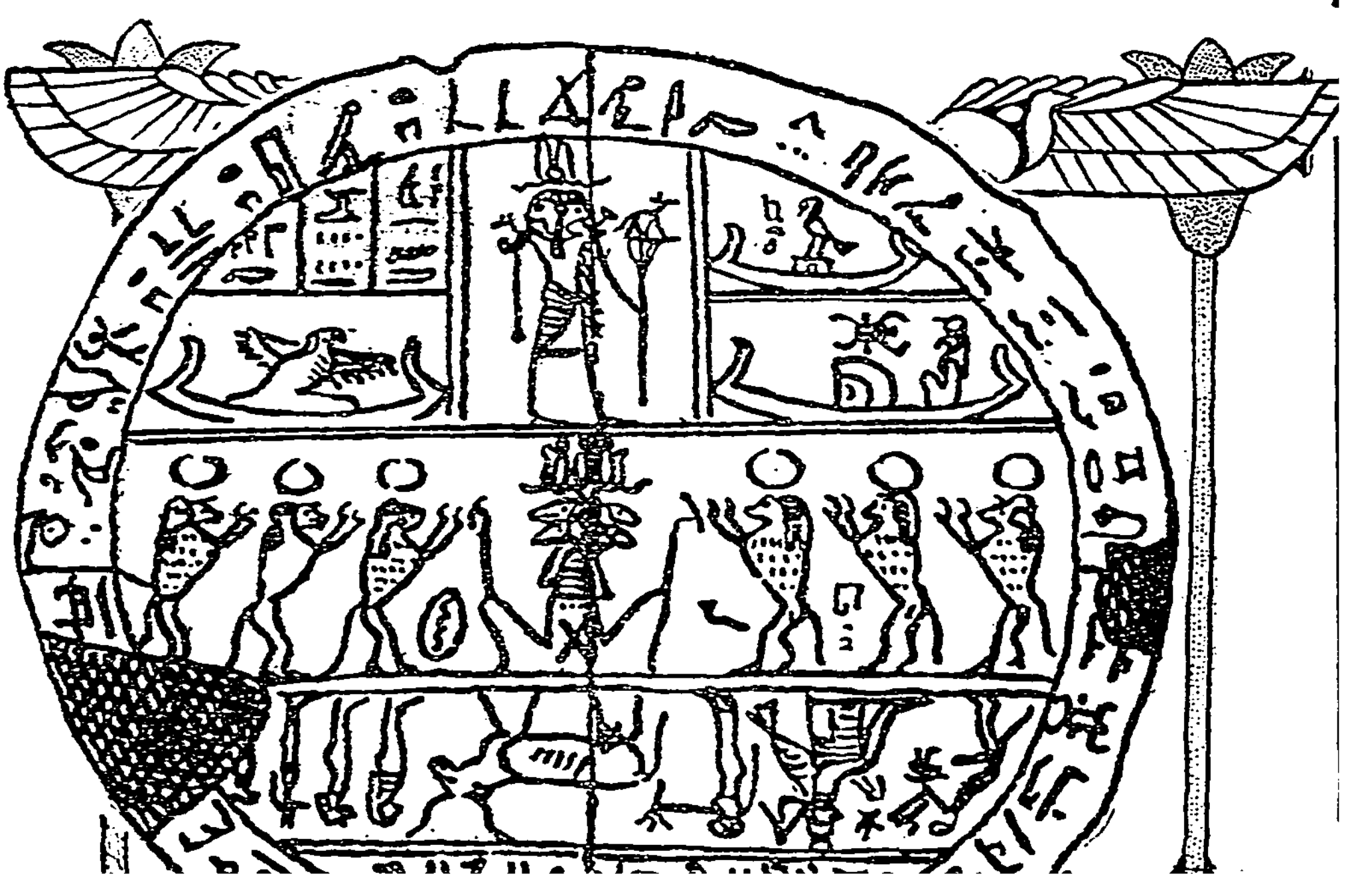
PLATE NO. 1-FROM THE BERLIN MUSEUM COLLECTION.

THE sacred books of the Mormon Church, which this wholly American cult proclaims to have been given divinely to the first Mormon prophet as a solemn addenda to the known Scriptures, have now been in circulation in Mormondom for about seventy years. On their faith that the texts were really produced through the gift and power of God, hundreds of thousands of devotees have hailed Joseph Smith as the "prophet, seer, and revelator" of God, and God's spokesman on earth. His successor, Joseph F. Smith, the present prophet, they hail by the same title, and so strong is their faith that the prophet wields unlimited power in politics, in finance, and in religion in at least two Western States.