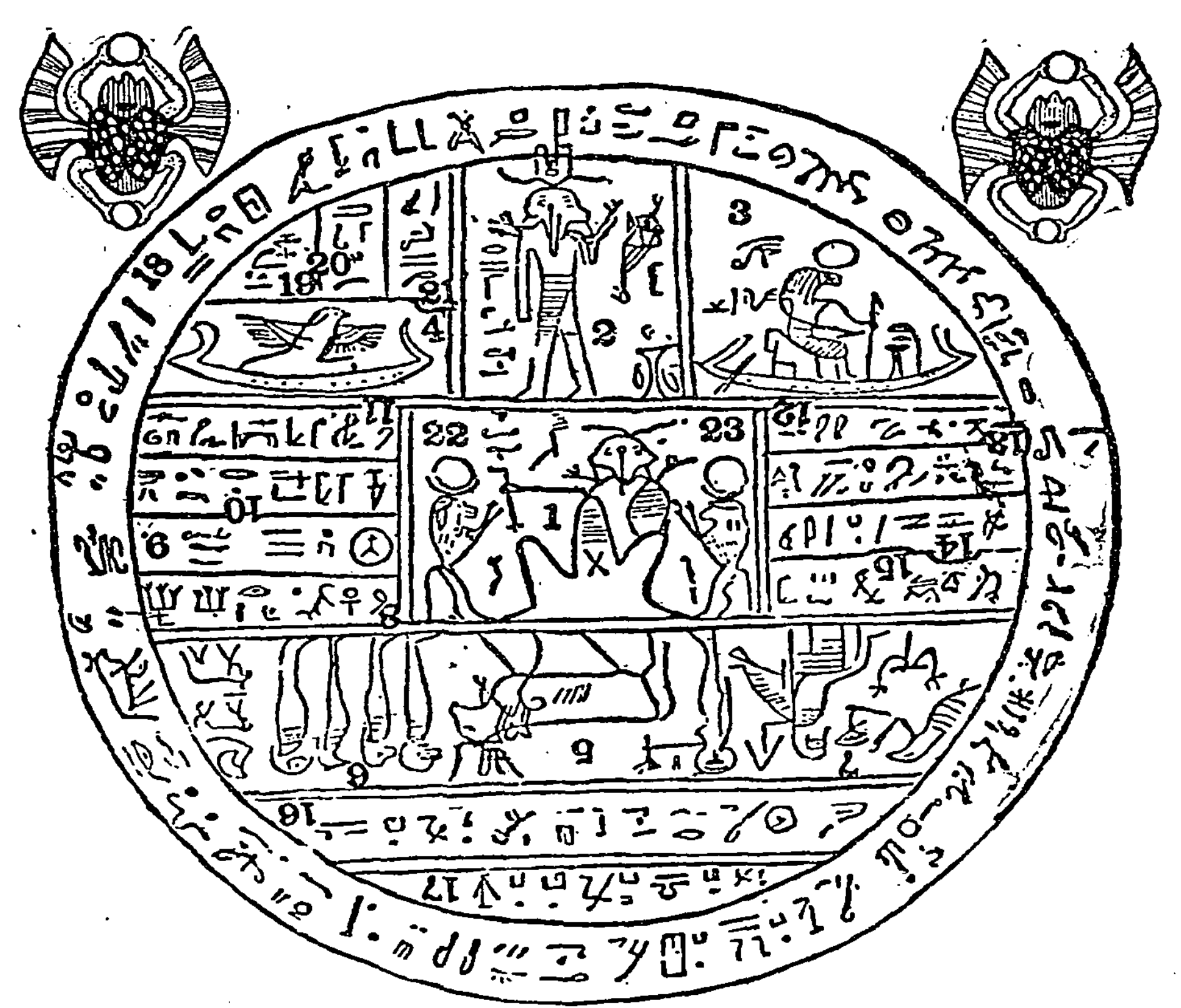
PLATE NO. 4-FROM "THE PEARL OF GREAT PRICE."

"Sad copies of very familiar papyrus," he said, "and a sadder, a much sadder,