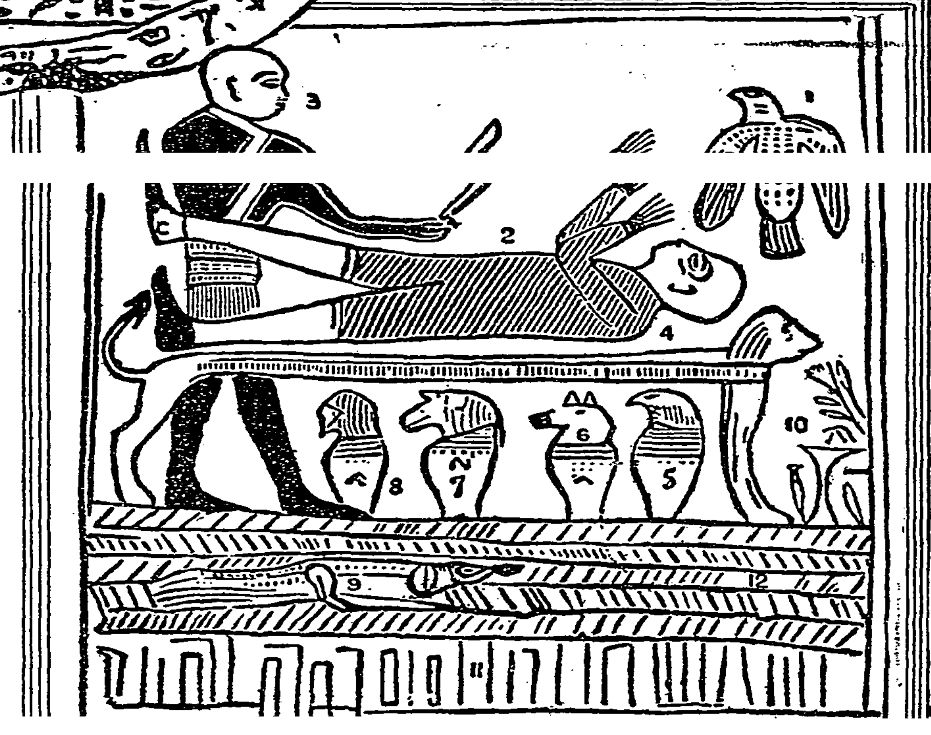
PLATE NO. 2-FROM "THE PEARL OF GREAT PRICE."

As his followers already had a good deal of new scripture in his own special revelations, and from the writings