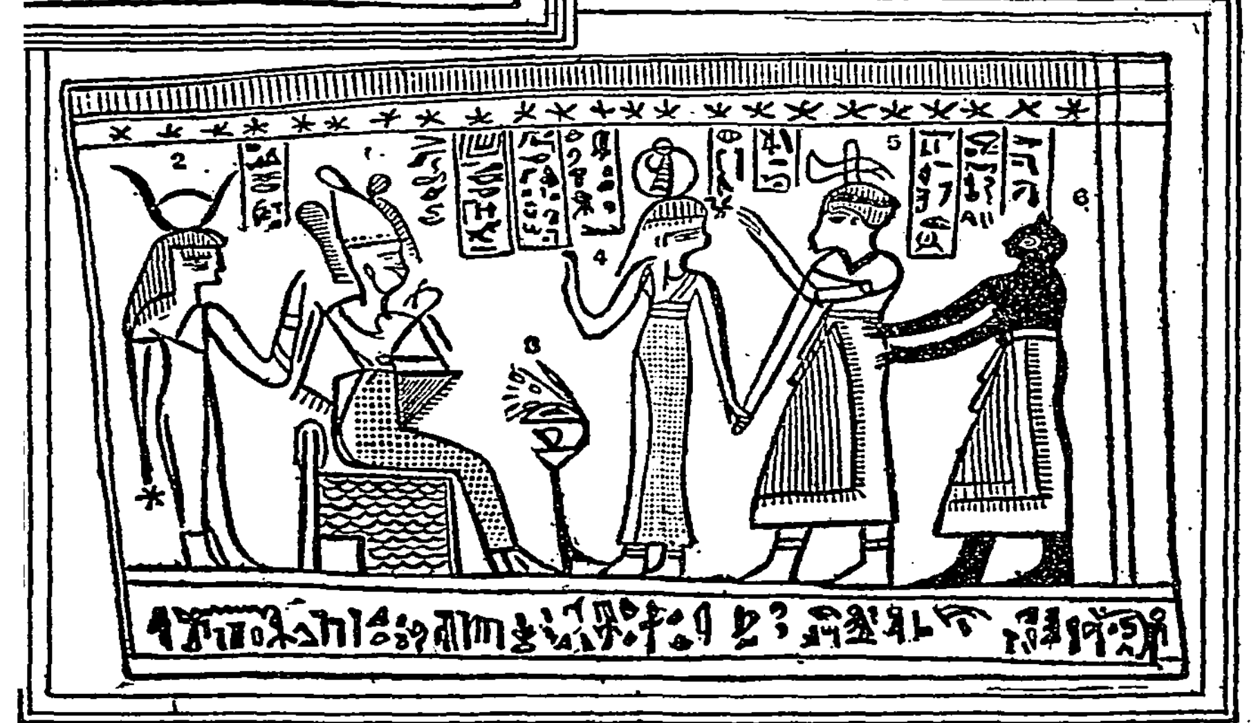
PLATE NO. 3-FROM "THE PEARL OF GREAT PRICE."

The "Doctrine and Covenants" consists of the laws which God, in His infinite wisdom laid down directly by word of mouth to the Prophet Joseph Smith. No witnesses were called in to